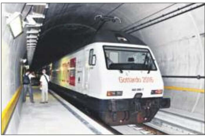
Between 2 August and 27 November 2016 a special train ran once per day to Sedrun, the multifunction and emergency crossover station, situated deep under the Alps and 21 km from the northern portal of the GBT, where an exhibition was provided. Close on 50,000 people visited this exhibition. To move them a Class Re 460 with a rake of five single deck carriages was used, operating in push-pull mode. Such was the popularity of these events that the trains had a load factor of 99.5% -a figure most operators could only dream of achieving! This photo shows a special train hauled by Re 460 098 on 31 August 2016.

On 5 December 2016 the BAV granted SBB final approval for starting up a full service through the GBT line. Only a few minor limitations remained, to be cleared up later. One of these involves the sidings situated at Rynächt, to the north of the new line. Here a speed limit of 80 km/h remains