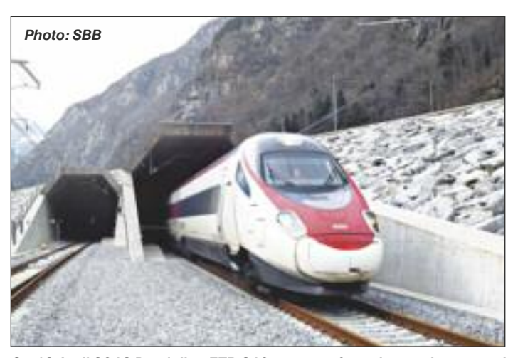
On 12 April 2016 Pendolino ETR 610 emerges from the southern portal of the GBT.

Classes Re 4/4 and Re 6/6 never had any ETCS problems. Also SBB Cargo International's Class 189 Eurosprinters on hire from MRCE and ELL's Class 193 Vectrons were ready for the startup of full commercial operation on 11 December 2016