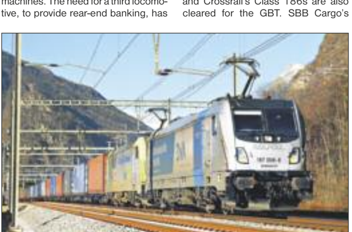
On 1 December 2016 BLS's TRAXX 187 008, on hire from Railpool, leaves the southern portal of the GBT. This class received a new operating permit from BAV for the GBT line on 28 November 2016, following the upgrading of their onboard EBI Cab 2000 ETCS. Those 187s which have not yet been subjected to the upgrade can still use the tunnel, but not in the position of leading locomotives.

Test runs realised with the new Class Re 475 Vectrons were realised satisfactorily. DB Cargo's Class 185s and Crossrail's Class 186s are also